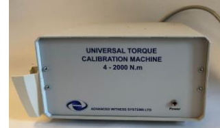
Bench mounted machine with Torque Transducer Sliding Carriage and 2kNm Master Transducer, alongside the control box.